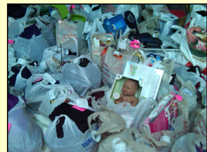
Where’s Waldo? Christmas bags getting ready for the wrapping table!

Warm clothing is still available to our community members in need.